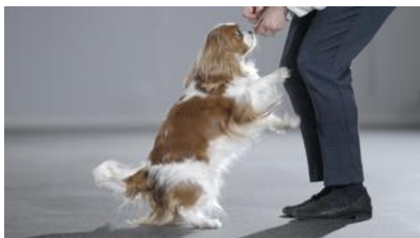
Beth and Flora