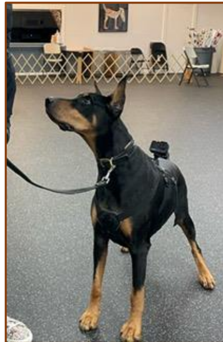
Boon wearing a camera for a dog's eye-view of freestyle